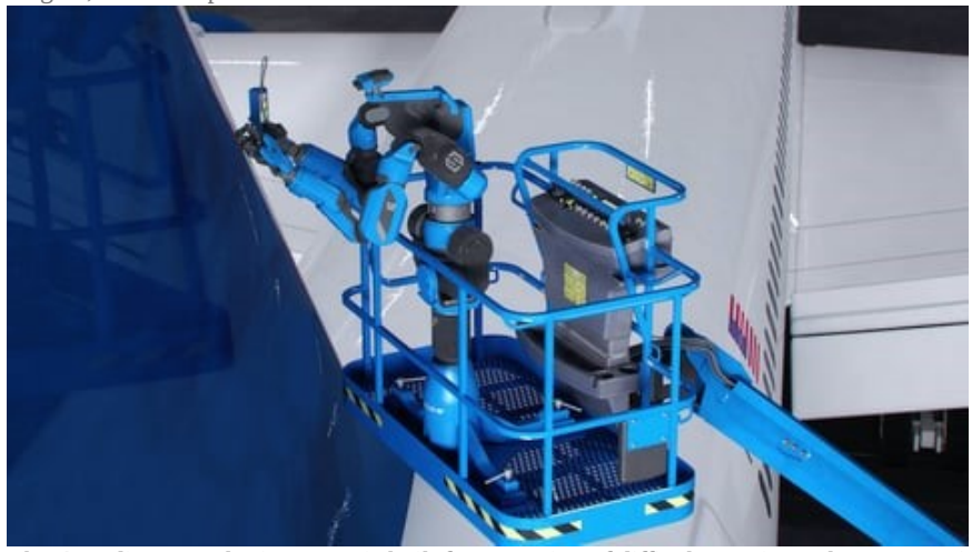
The Guardian XT robotic system is built for execution of difficult, precise tasks, not repetitive ones. (Sarcos Robotics)

Sarcos Robotics announced Thursday that it completed three successful field demonstrations of real-world industrial use cases for its Guardian XT mobile robotic system, the upper-body portion of the company's Guardian XO industrial exoskeleton, which Sarcos is aiming to make commercially available by the end of next year.