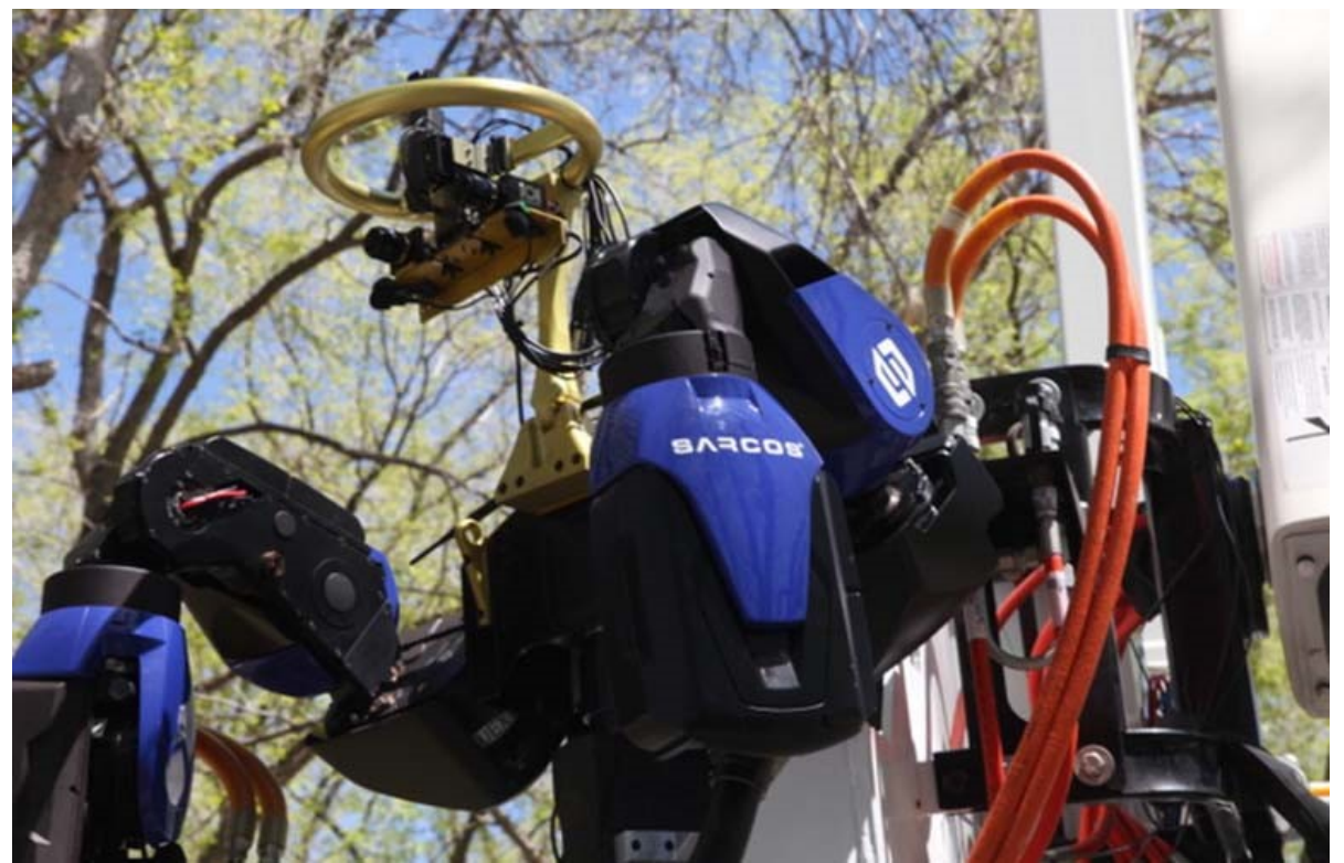
The Guardian XT robot can now be controlled in real time over a 5G connection.

Sarcos Robotics (Sarcos) and T-Mobile (NASDAQ: TMUS) today announced a collaboration to integrate T-Mobile 5G into the Sarcos Guardian XT highly dexterous mobile industrial robot. The Guardian XT robot is a remote-controlled robotic system designed to help humans safely work in hazardous conditions, performing tasks such as lifting heavy materials or using power tools at significant heights. With T-Mobile 5G integration, the companies aim to improve performance and response time for remote operations, so the robots can perform tasks more quickly and more in tune with their operator's movements.